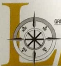
GROUND FLOOR PLAN OF BLOCK-A

Loharuka Niket, DC-9/28, Shastri Bagan, Deshbandhu Nagar, VIP Road, Kolkata -700059